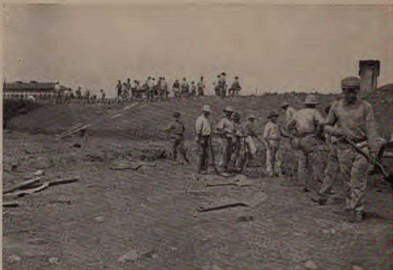
A Gang of Greeks